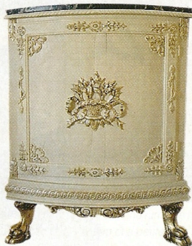
left: The original finish on this French console had deteriorated badly. Herb introduced a new color scheme with six shades of cream, burnished over the gold leaf, and gilded areas of the carved detail.